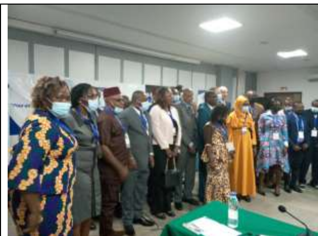
WORKSHOP: Towards a better access to the regional and international market of fishery and aquaculture products March 10-11 2022