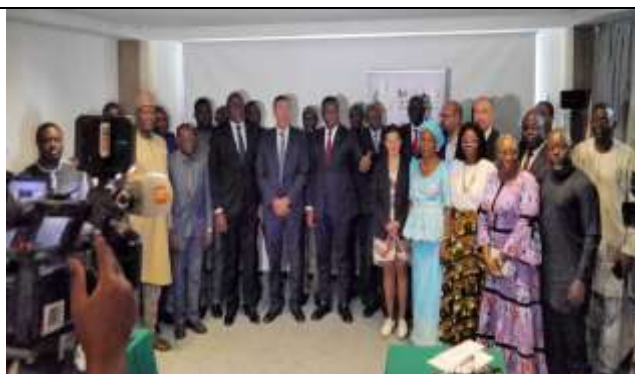
ATLAFCO/INFOPÊCHE REGIONAL SEMINAR 2023

“For better market access for fishery and aquaculture products: Improved quality control and control of Relevant International Instruments” March 16-17 2023